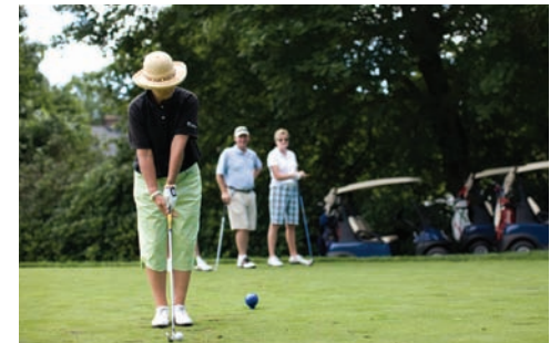
Pat Bradley, LPGA Hall of Fame Member