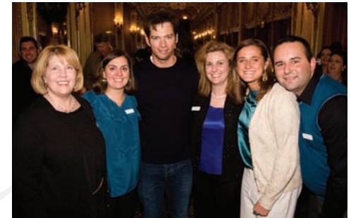
Harry Connick, Jr. and the Ovations Staff

of ovarian cancer cases are diagnosed at the most treatable stage.