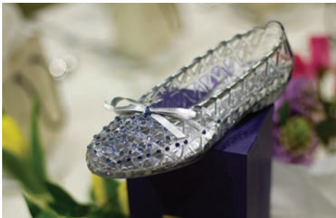
“Happy Feet” Shoes